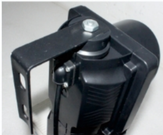
Installation: Horizontal Figure 2