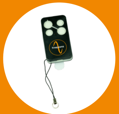
FREQUENZ transmitter, universal