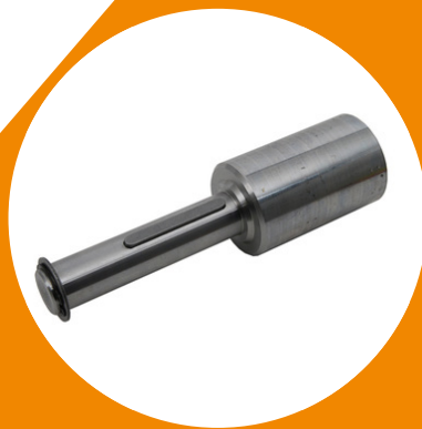
Crawford shaft extension, round 35mm