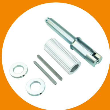
Hörmann shaft extension, 40mm with key way