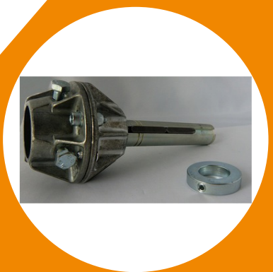
Hörmann shaft extension