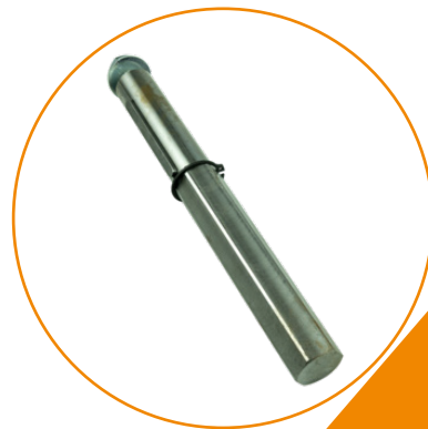
Crawford shaft extension SW25/SW27