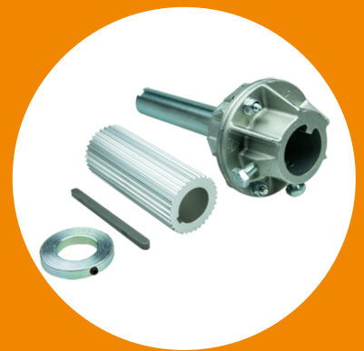
Crawford shaft extension, with key way